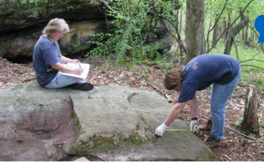
Left: Volunteers measure one of the boulders in Scripture Rocks Heritage Park as part of the site's documentation.