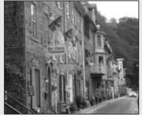
Jim Thorpe, part of the Delaware and Lehigh National Heritage Corridor, has benefited from DCNR funding.

It is clear that this Act could have gone much farther in providing funds to the Commonwealth and in protecting the environment. With the recent decrease in natural gas prices, the projected revenues will certainly decrease. Only time and careful monitoring of the issue will determine if this was the best legislation for the environment and the Commonwealth, and there will certainly be continued discussion on both sides of the debate.