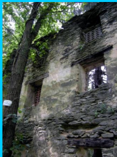
Camp Michaux, Cooke Township, Cumberland County