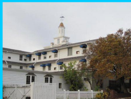
LOST - Mountain View Inn, Westmoreland County

For more information on any of the properties, visit www.preservationpa.org