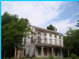
Fricks Lock National Register Historic District, East Coventry Township, Chester County