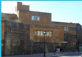
Sidney Hillman Medical Center, Philadelphia