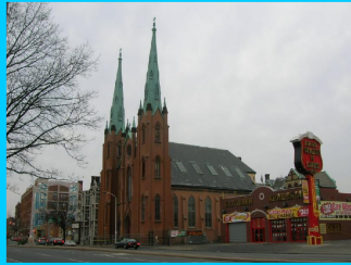
Church of the Assumption of the Blessed Virgin Mary, Philadelphia