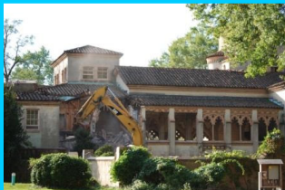
LOST- La Ronda, Bryn Mawr, Montgomery County Photo Courtesy of Carla Zambelli, 2009.