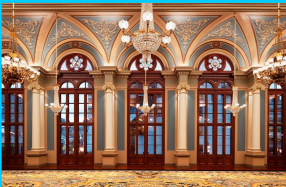
Academy of Music