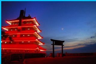
The Reading Pagoda