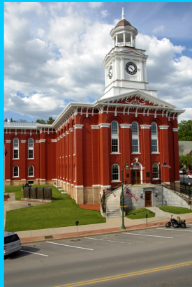
Jefferson County Courthouse