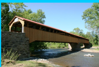
Academia/Pomeroy Covered Bridge

Honor Excellence by Sponsoring the Pennsylvania Historic Preservation Awards