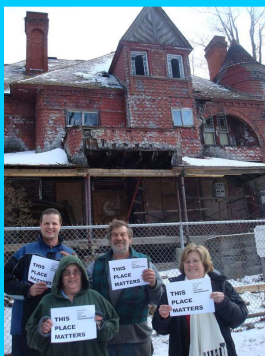
Braemar Cottage, Cambria County