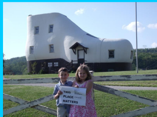
Shoe House, York County

Submit your own THIS PLACE MATTERS photo!