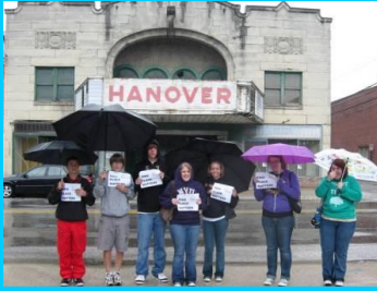
Hanover Theater, York County

Download the THIS PLACE MATTERS sign and send your photos to