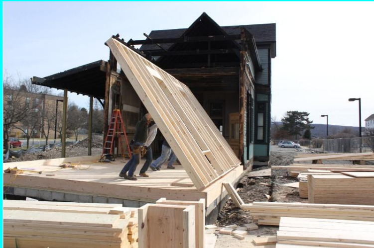
Improvements at the East Stroudsburg Railroad Station.

In December 2010, Preservation Pennsylvania included the East Stroudsburg Railroad Station on the Pennsylvania At Risk list.