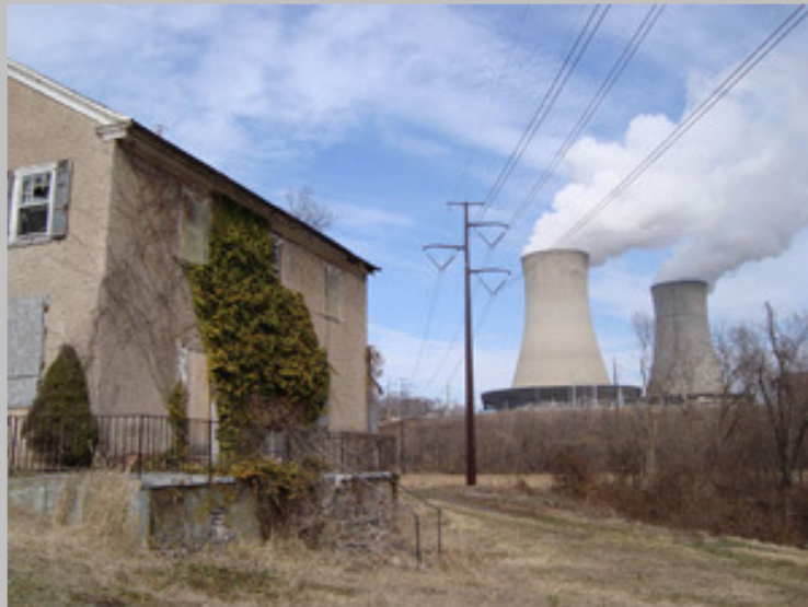
Frick's Lock, East Coventry Township, Chester County

After almost three years of monthly meetings between Exelon Nuclear, Preservation Pennsylvania, and East Coventry Township, an agreement to save the village of Frick's Lock was signed last month-- a victory for preservationists who have persistently advocated for the 250 year-old settlement.